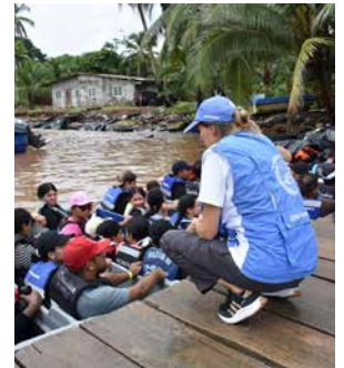
A UN Human Rights Officer speaks with migrants departing from Panama's Caribbean coast to Colombia, as part of a mission to monitor the reverse migration (north - south) and the vulnerabilities that migrants face along the route.

T o strengthen rule of law and accountability, OHCHR observed more than 1,300 judicial proceedings helping uphold fair-trial and due-process standards.