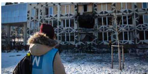
The UN Human Rights Monitoring Mission in Ukraine (HRMMU) team at one of the sites struck during the attacks on Kyiv. The photo shows a damaged medical facility, where one of the patients died as a result of the attack.