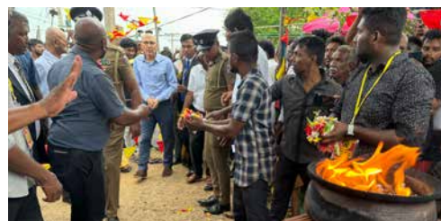
UN High Commissioner for Human Rights Volker Türk at a memorial site near Chemmani mass grave in Sri Lanka.